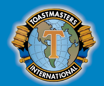
CATALOG NO. 121